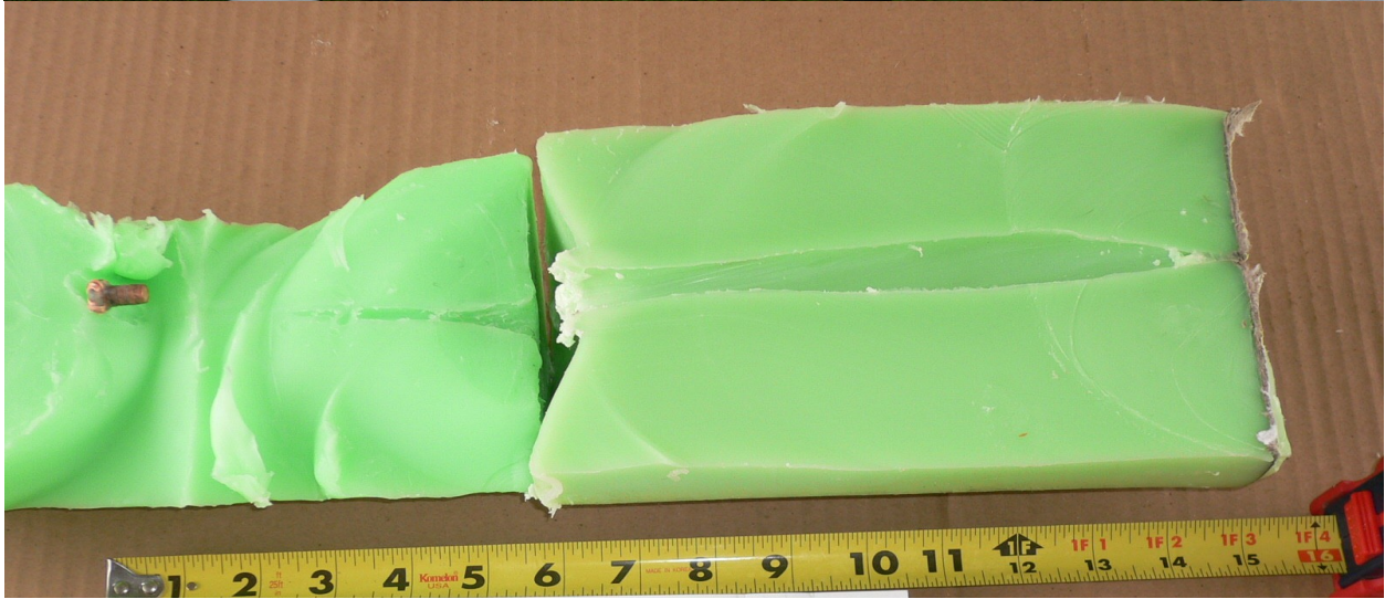
This is a 308 Win caliber Barnes 150 gr TSX bullet that penetrated 15" of the media.