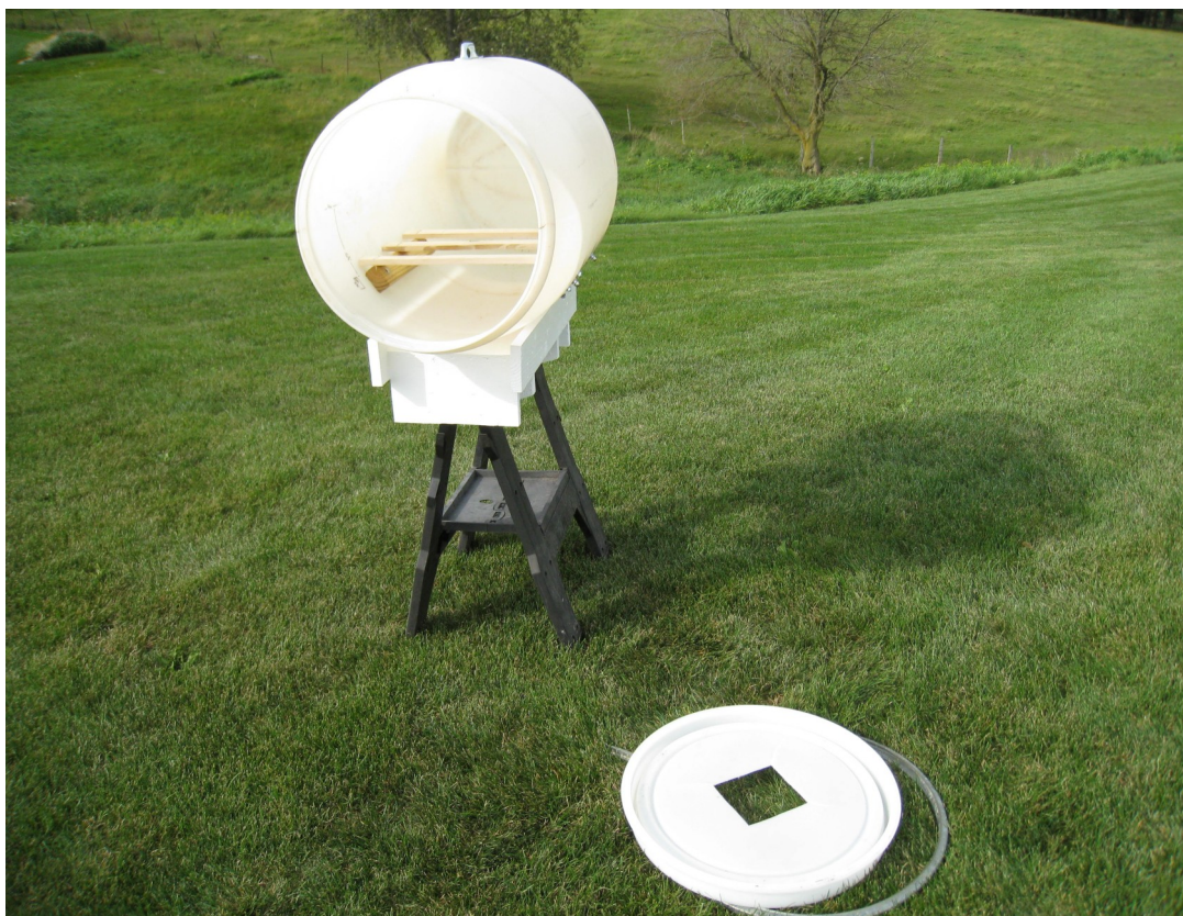
A regular 'ole rain barrel fitted to a carpenters horse works just fine.

Their break through in practical and hands-on information transfer to hunters of lead versus copper bullets inspired us to develop " a rain barrel recovery system " too. We now have a practical tool to invite hunters to come shoot their ammo and see how it performs compared to copper bullets. The rain barrel quickly allows the users to collect the bullet fragments, including lead particles for comparison with copper bullets that they just shot.