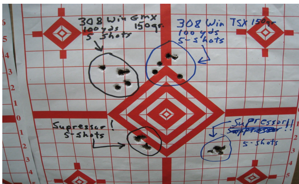
308 Win TSX and GMX 5-shot groups, with & without the suppressor, at 100 yards!!

The current ammunition for the Department 308 Winchester rifles is the Federal Premium 150 grain round with the Nosler Ballistic Tip bullet. This has been an accurate round and it has proven itself in anchoring deer in culling activities. The Barnes TSX, TTSX and Hornady GMX rounds that we tested were every bit as accurate, both with and without a suppressor. They hold together in mushrooming, retaining all their weight, unlike lead core rounds. Five-round groups shot from a bench and utilizing a "lead sled" shooting platform easily gave groups of 1½" groups at 100 yards for both Barnes and Hornady loads.