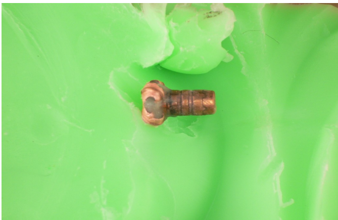
This is a close up of the bullet, 100% weight retention and a perfect mushroom.