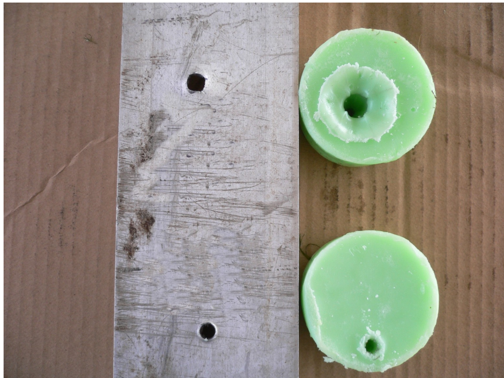
270 Winchester, 130 gr @ 1,800 fps (reduced load) 1 1/2" media + 1/4" aluminum

Top bullet is Hornady GMX. Bottom bullet is Barnes TTSX. Note the much larger exit holes with the TTSX which shows this bullet expands quickly, even at low velocities.