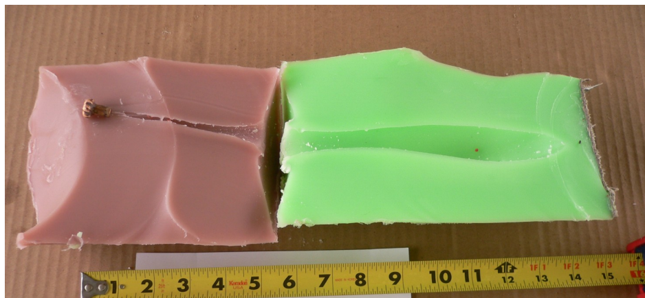
Hornady GMX 308 Win bullet, also with 15 inches of penetration.

Notice the 6 petals on the GMX bullet; there are 4 petals on the TSX bullets